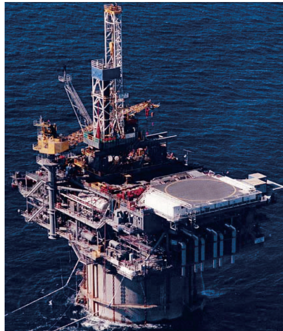
Photo depicts a typical floating production rig installation

Platform rigs are supplied on a new-build basis, subject to contract term.